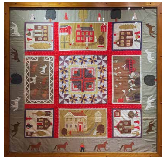
This intricately detailed coverlet is on display at the Mennonite Life museum